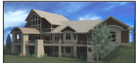
PARADE HOME # 1

See all the details on this Rustic Elegant 11,500 sq. ft., 5 bedroom, 7 bathroom home at www.hbasiouxempire.com .